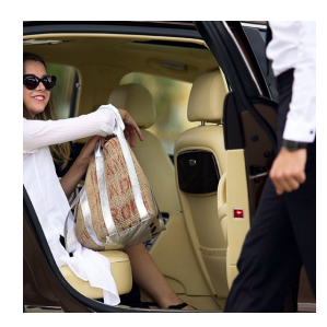
Executive Private Transfer - London Hotel to Heathrow Airport Duration: 35 mins

After breakfast, meet your driver for your private transfer to Heathrow Airport to continue on to your next Avanti destination! (Breakfast)